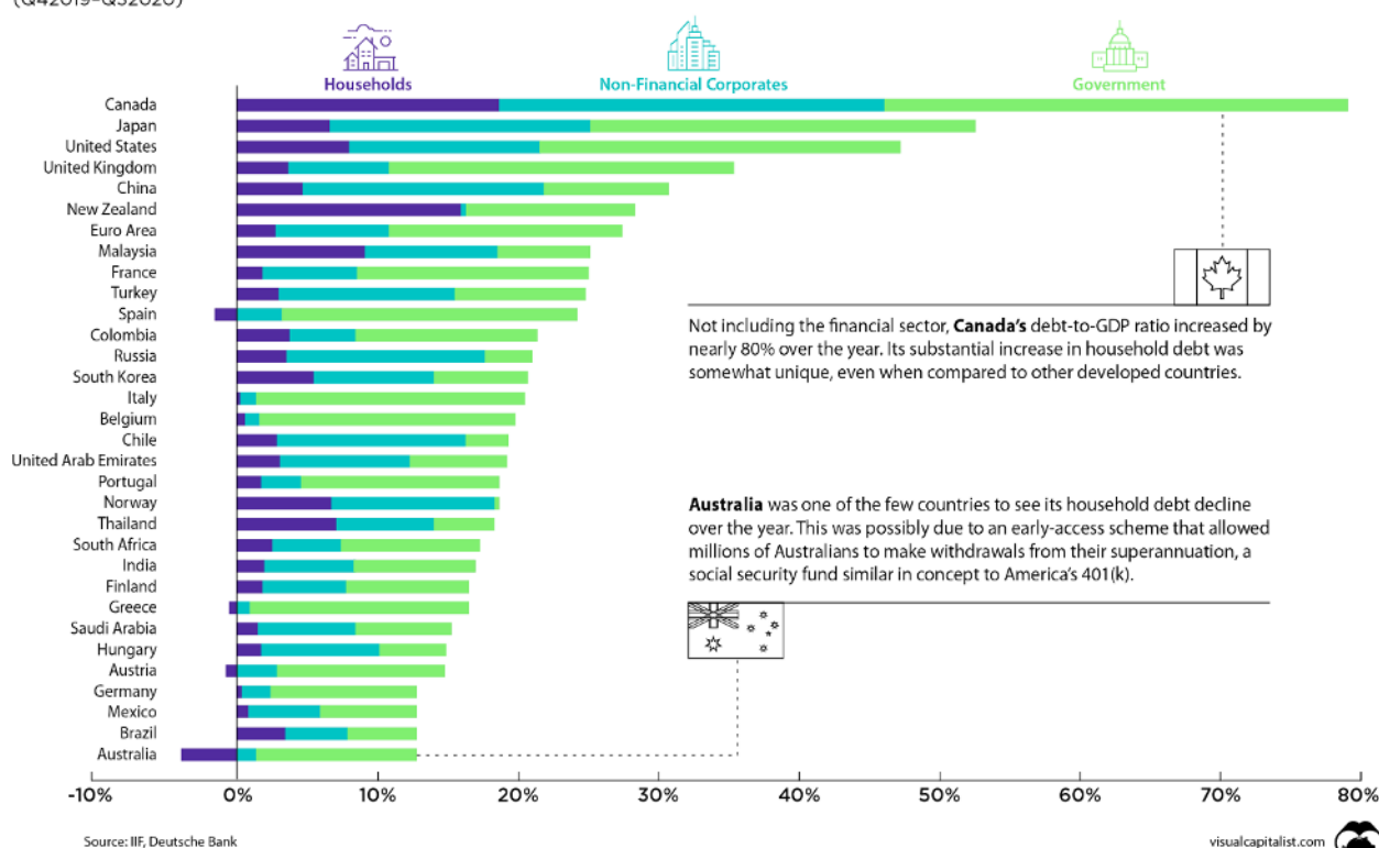
CHANGE IN DEBT-TO-GDP (Q42019–Q32020)

https://www.visualcapitalist.com/debt-to-gdp-continues-to-rise-around-world/